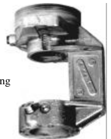
EE304900 Spindle Housing Converted U to R

For assistance in eliminating premature or repeat failures, take advantage of our instructional program in Southern Pines.